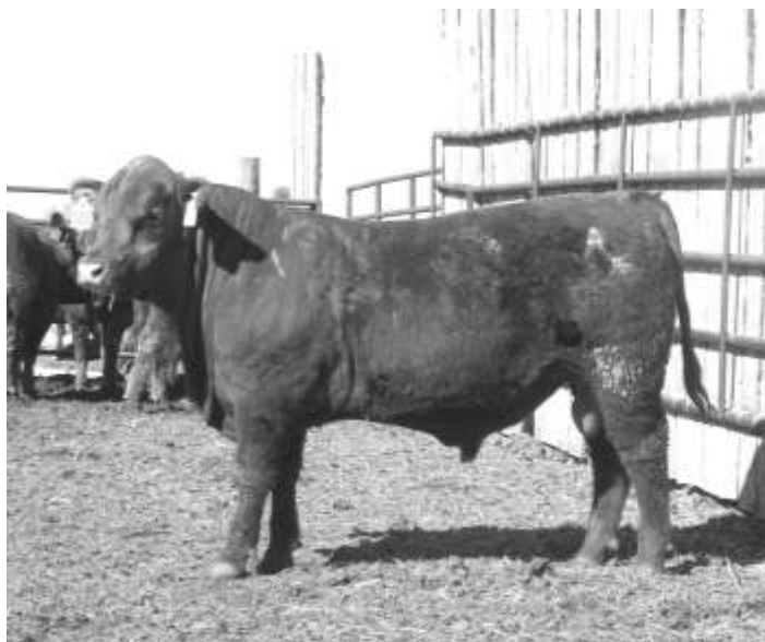
Lot 10 - Axtell Golden Boy 0355