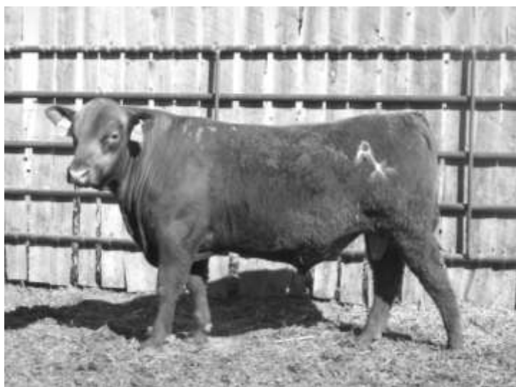
Lot 5 - Axtell Cody 0944