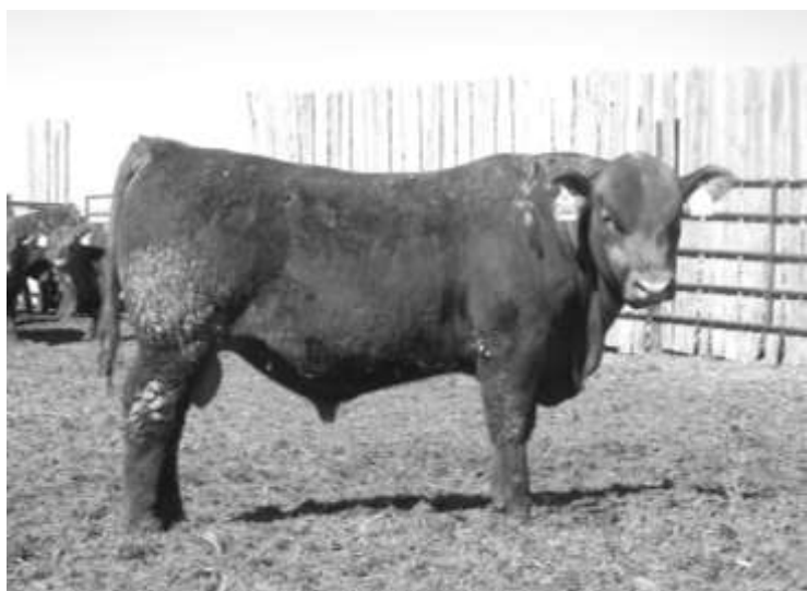
Lot 3 - Axtell Nebula 0660