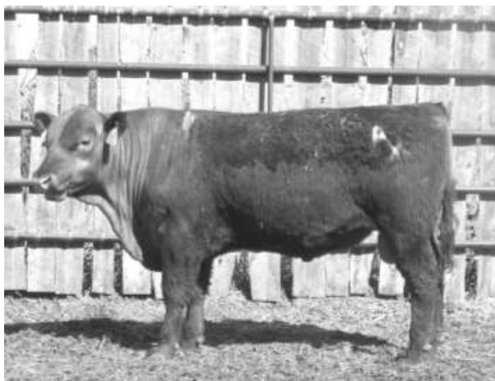
Lot 27 - Axtell Look Out 011