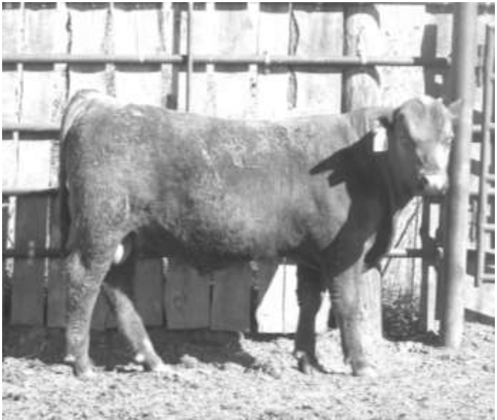
Lot 29 - Axtell Pay Day 0411

Lot 29 stacks Bootjack Ranch pedigrees and is out of one of the better cows in the Lonker Dispersal. She is easy keeping and good uddered. I like his chances of producing nice females.