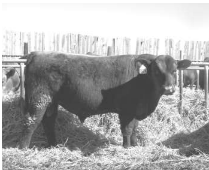
Lot 11 - Axtell Nebula 269 0124