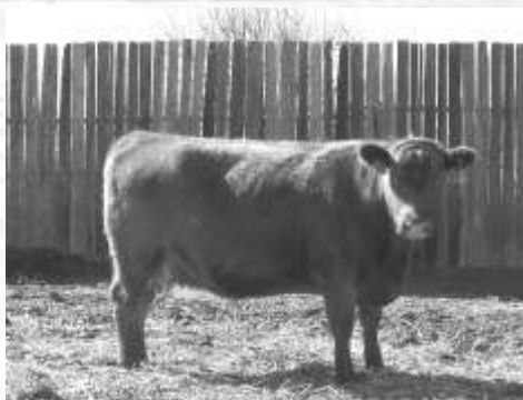
AX Lana 02-616 Dam of Lot 8

Lots 22, 23, 35 and 36 go back to this great cow She was in the herd until 14 years of age. She had the best feet and udder of any cow we've had. She was our original Red Angus cow.