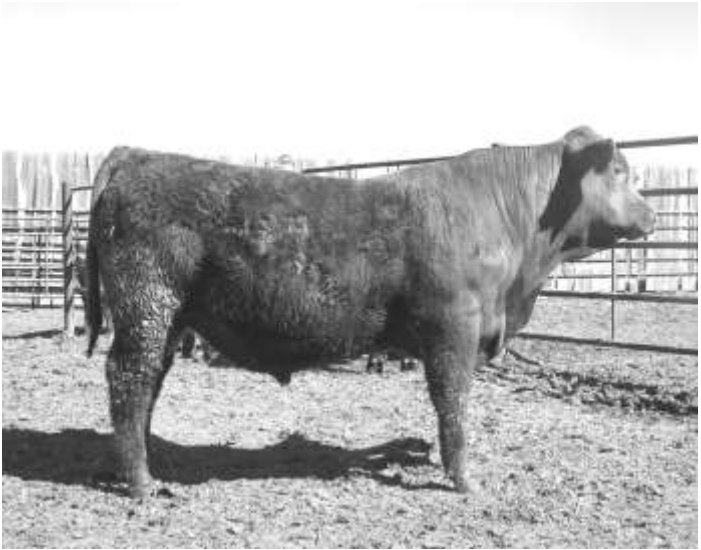
Lot 7 - Axtell Cody 0518