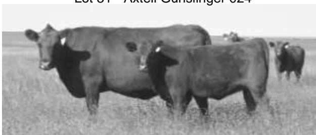
Dam and Sister of Lot 31