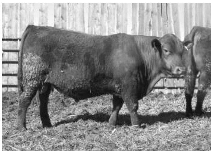
Lot 12 - Axtell Cody 0516