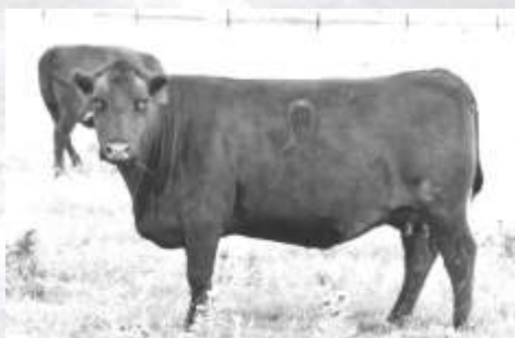
LCHMN SYRINGA 1080

She is a small cow with a great udder that always does a good job for us. She is the dam of reference sire—Axtell Pay Day 8205