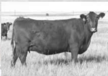
AX LANA 205 Dam of Lot 6

She is a small cow with a great udder that always does a good job for us. She is the dam of reference sire—Axtell Pay Day 8205