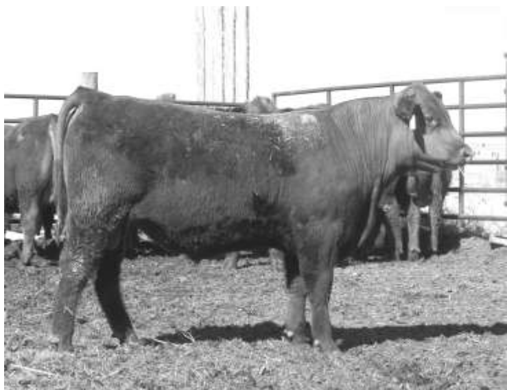
Lot 2 - Axtell Pay Day 036