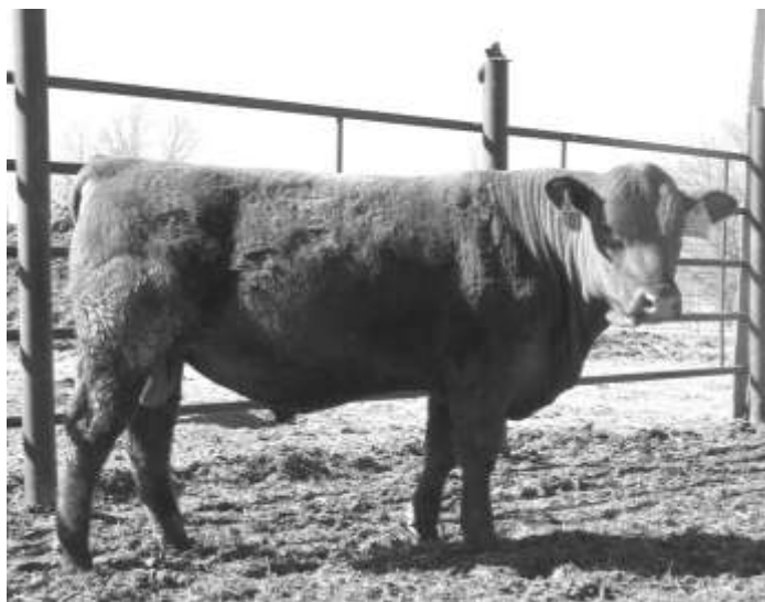
Lot 13 - Axtell Gunslinger 0707