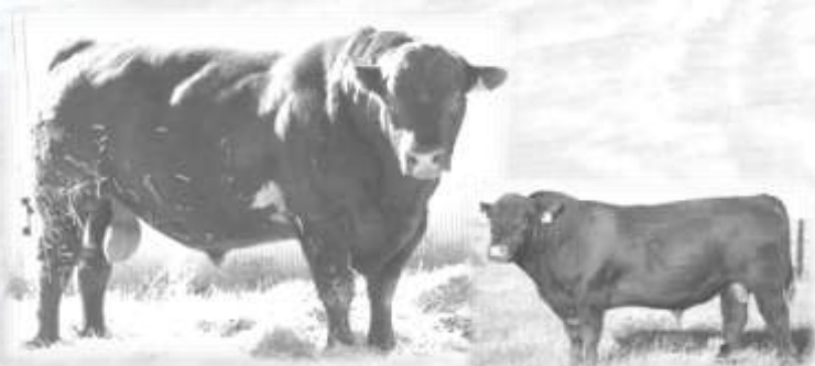
FORSTER GOLD 3109