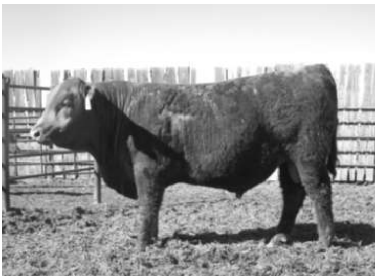
Lot 4 - Axtell Nebula 0606