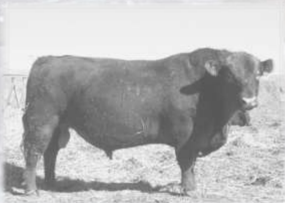
BECKTON CODY T008 K2