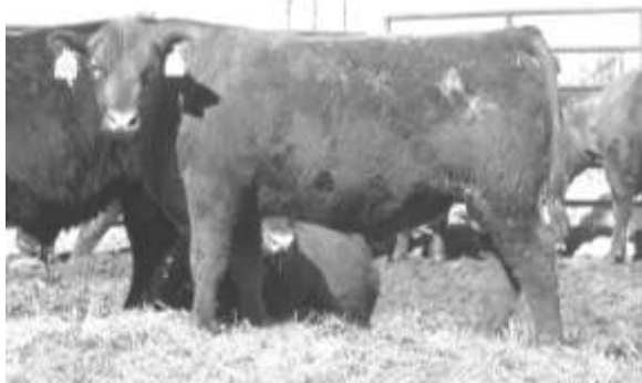
Lot 31 - Axtell Gunslinger 024